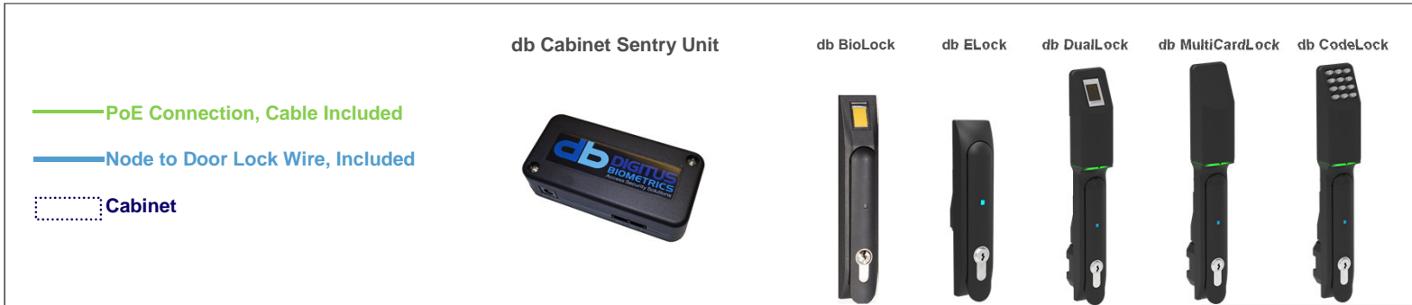
db Cabinet Sentry Unit